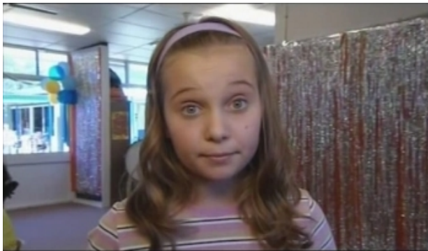
close up shot